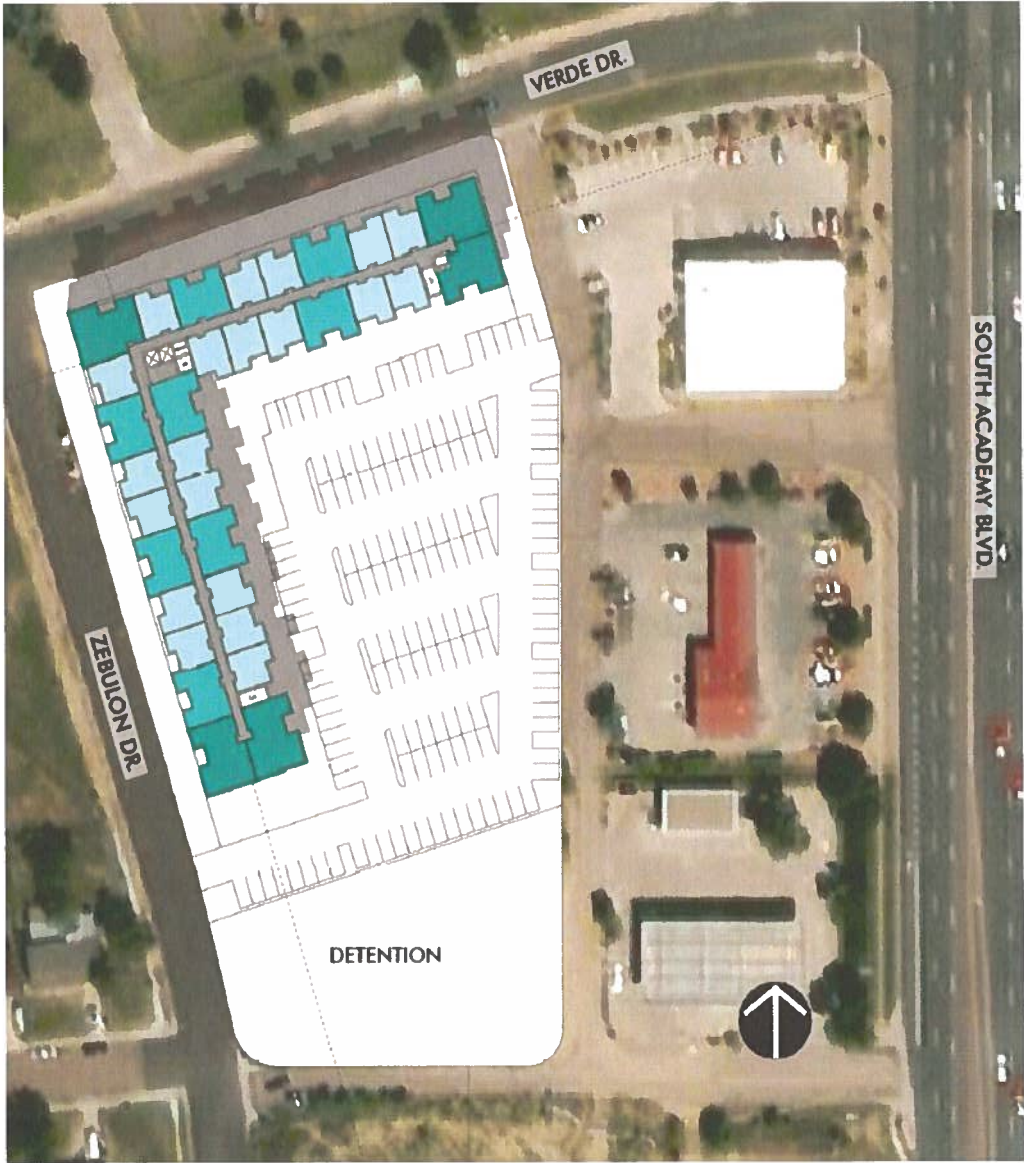
Figure 2. Almagre Site Plan