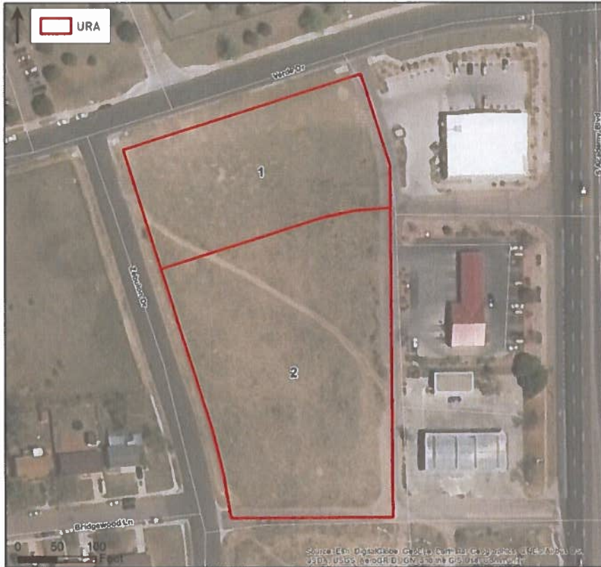
Figure 1. Almagre Urban Renewal Plan Area