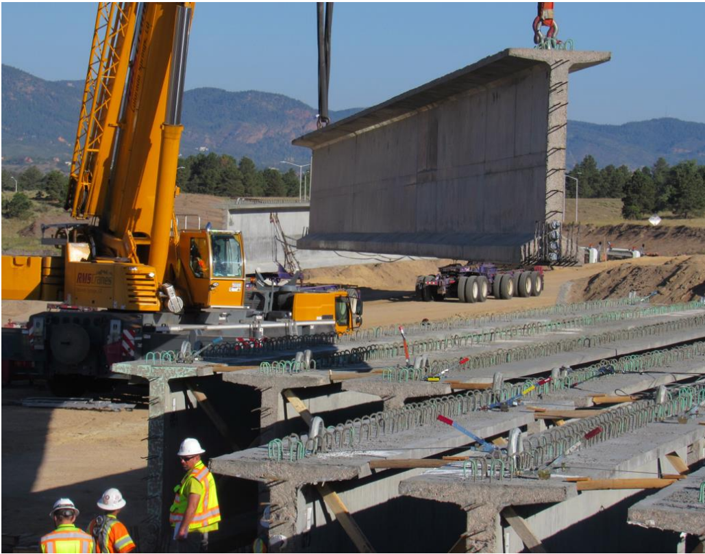
The girders for Bridge DF are bigger. These girders are 7.5-feet deep and 200-feet long. Each girder weighs approximately 100-tons. The girders were set on September 3 rd and 4 th .