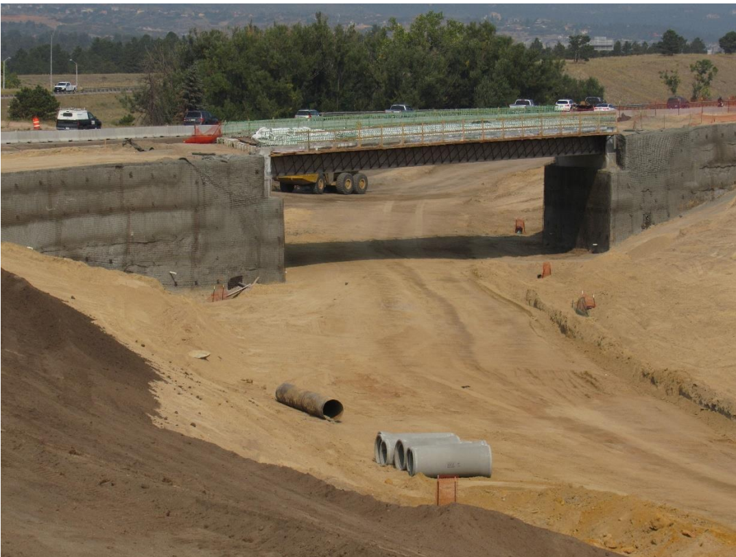
July 20 th , the deck was poured for bridge DK. Traffic from westbound Powers to northbound I-25 goes under the DK bridge. Traffic from northbound I-25 off ramp to North Gate Boulevard goes over the DK bridge.