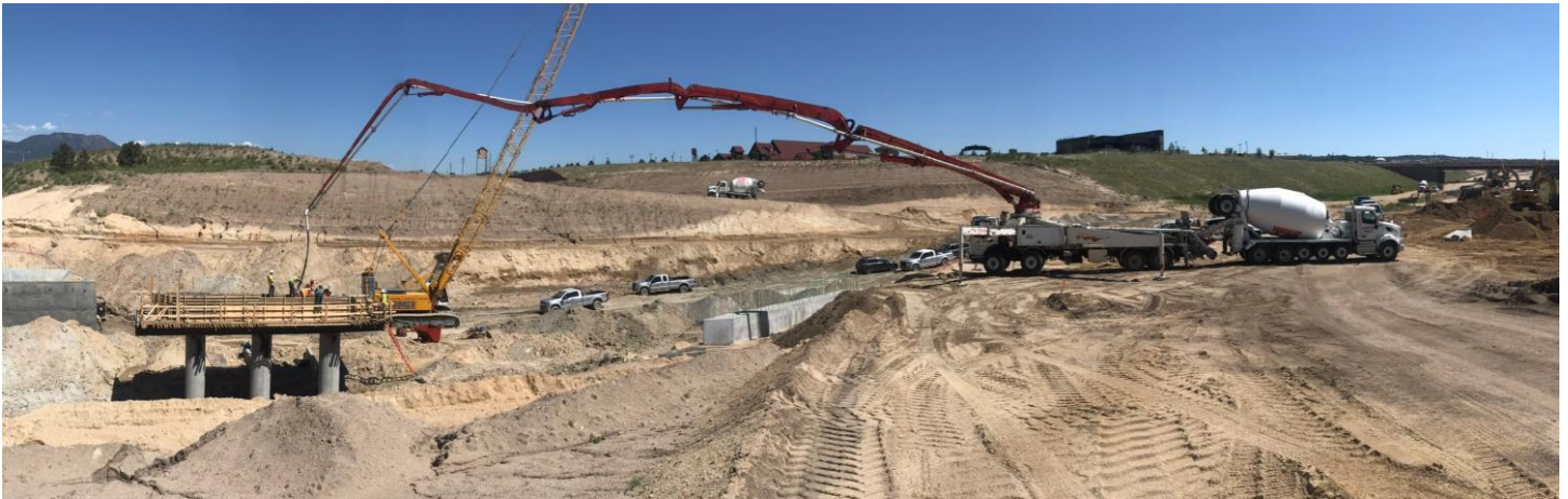
July 8 th , Pier cap was poured for bridge QJ. Bridge QJ accommodates the off ramp from southbound I-25 to eastbound Powers and goes over westbound Powers ramp to southbound I-25.