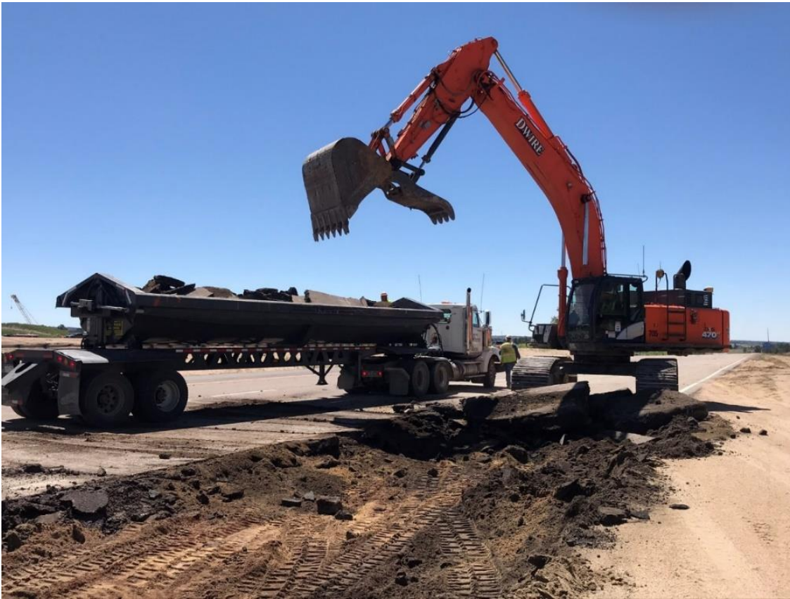
After the detour is opened, Dwire Earthmoving out of Colorado Springs removes the pavement necessary to install the new southbound I-25 bridges (DF & DH).