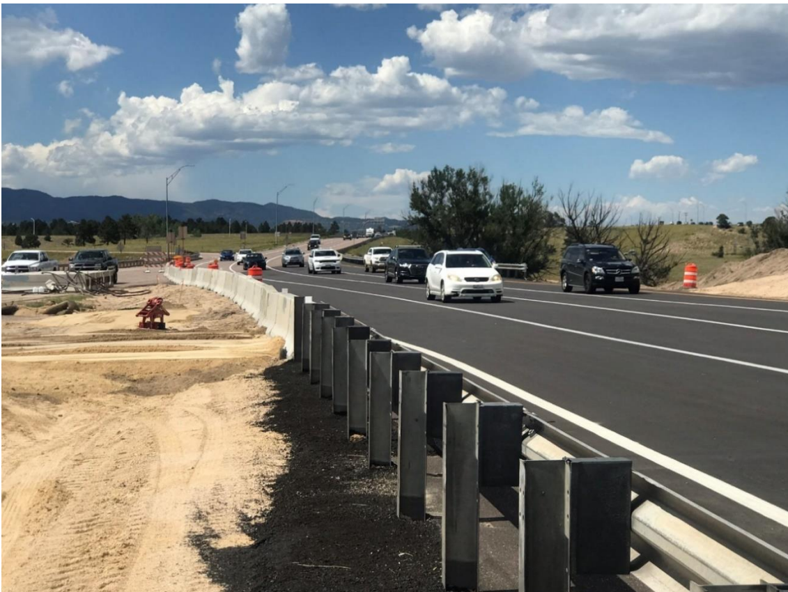
Southbound detour was opened to traffic on July 2 nd . This allows work to begin on the two southbound I-25 bridges.