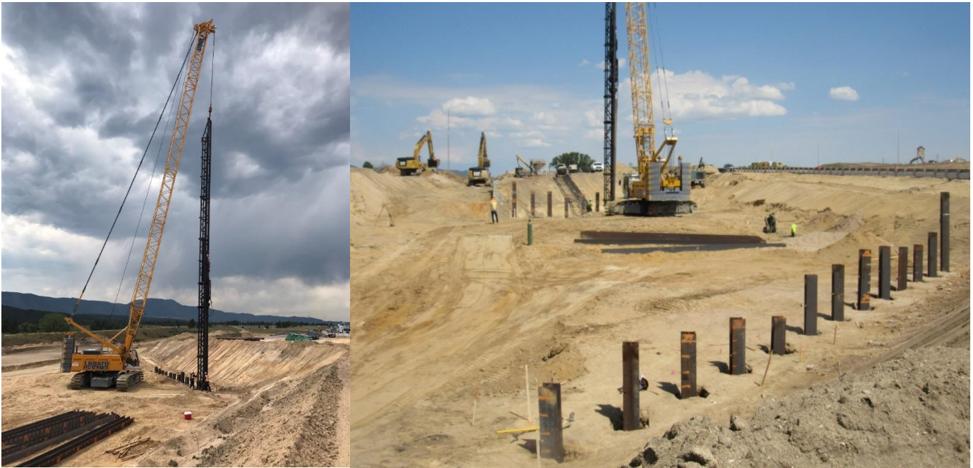
Using a pile driver, the piling are driven to refusal.