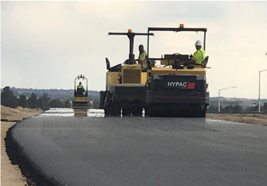
June 23rd, Pyramid Construction out of Colorado Springs, starts paving the southbound detour.