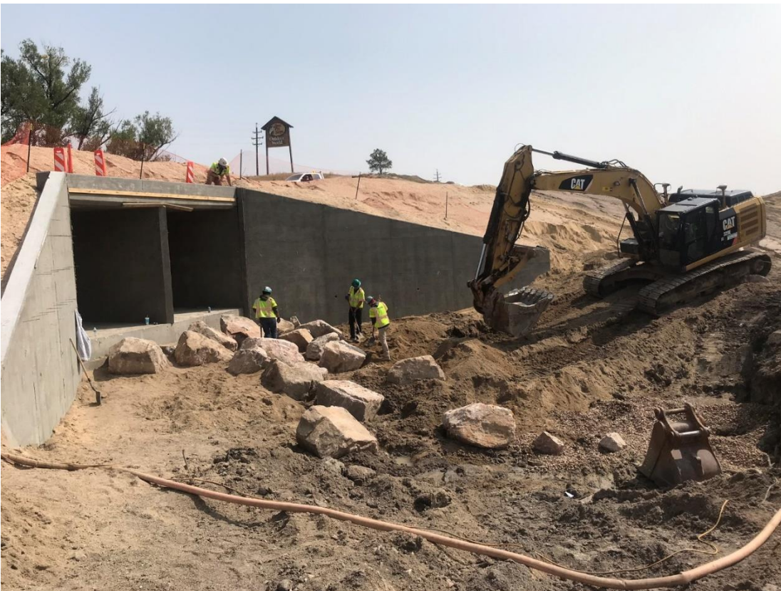
Box culvert H is being backfilled and large rock placed at the outlet to slow down stormwater flows.