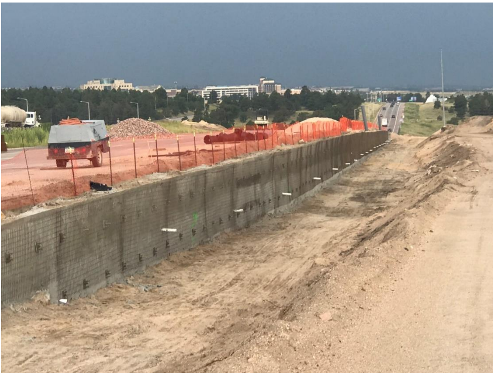
HTM Construction out of Lakewood, Colorado is constructing a soil nail wall along the west side of southbound I-25. The new on-ramp to southbound I-25 will be to the right of the wall. The wall will receive an aesthetic structural coating.