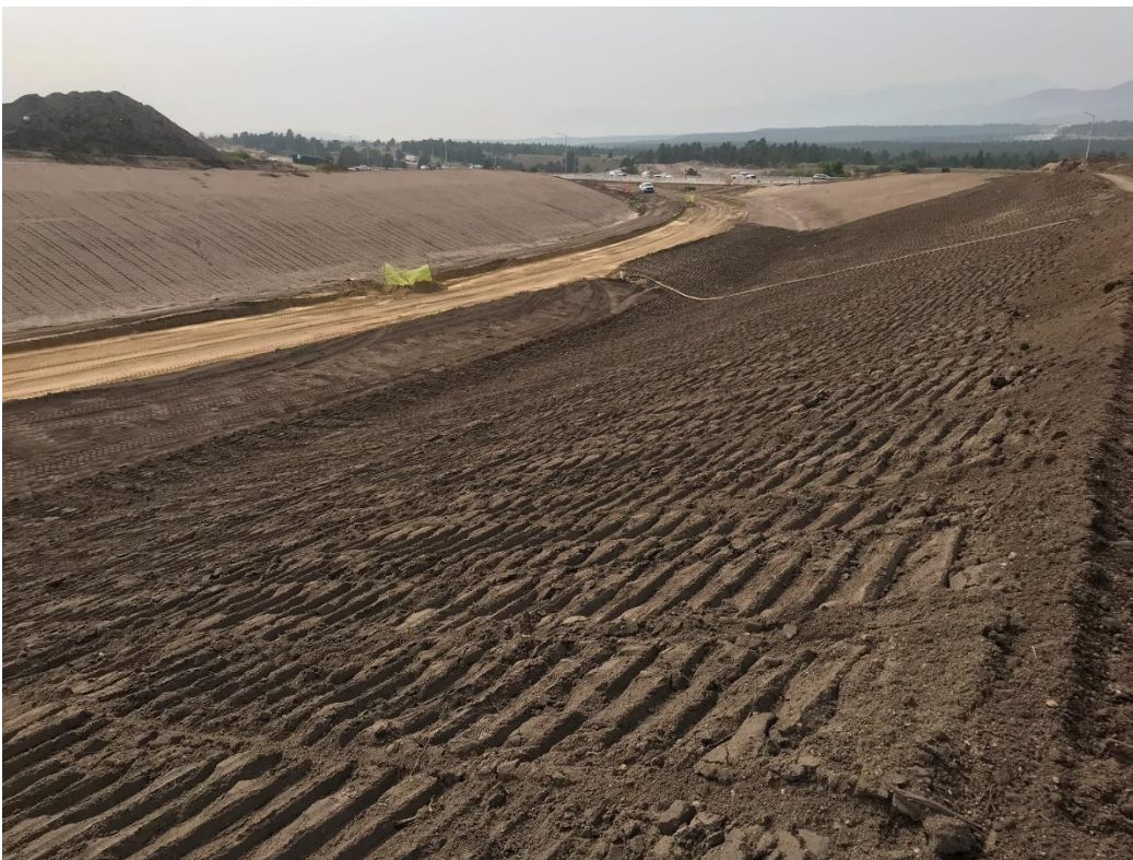
Looking southwest at the location of the northbound I-25 ramp to eastbound Powers. The slopes were recently topsoiled and will be seeded soon.