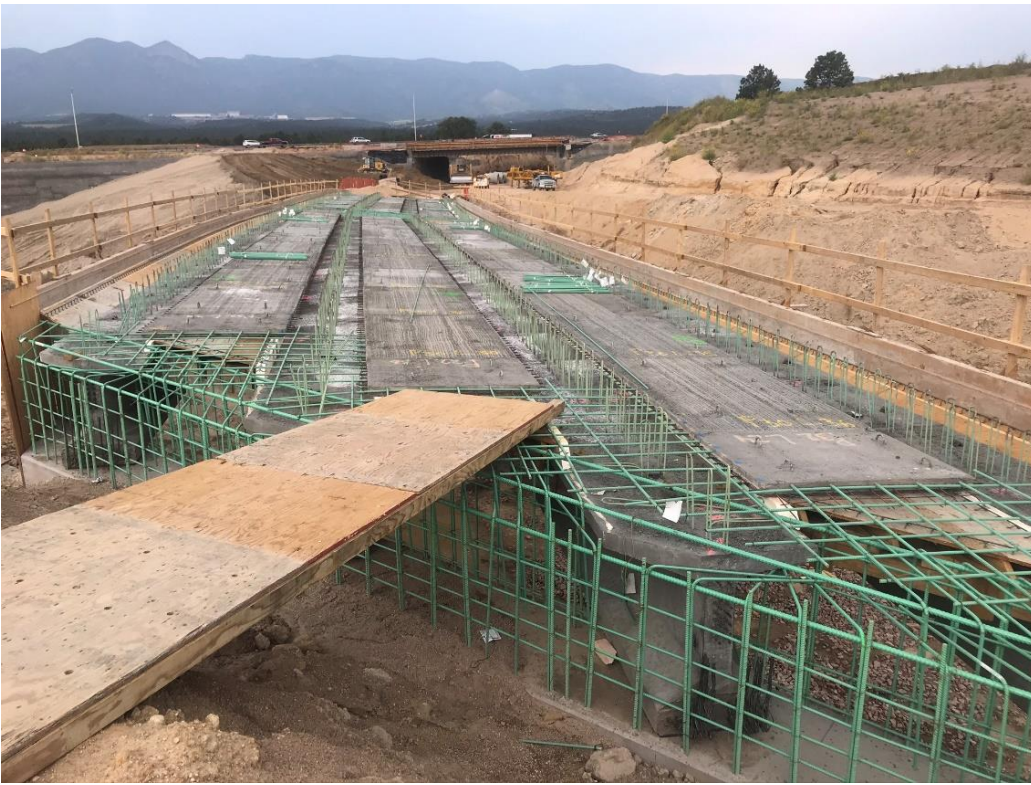
Bridge QJ is two-span with a slight curve. Prestressed concrete deck panels are placed between the girders.