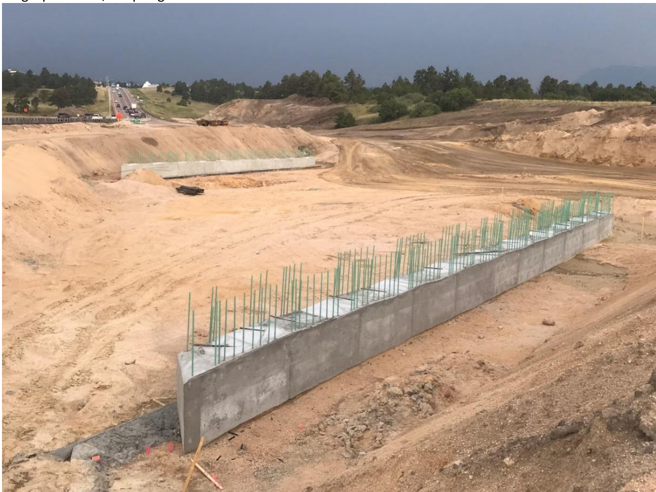
After the piling are in place, they are cut off and encased in concrete – the abutments. Bridge DH is being built on grade, which means the dirt will be removed after the bridge is constructed.