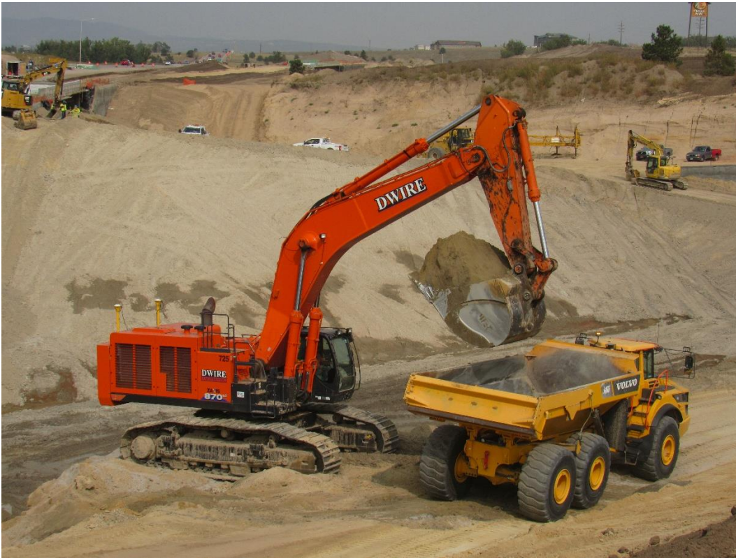
Dwire Excavating out of Colorado Springs continues to move dirt. Approximately 1,500,000 – cubic yards have been moved. Several hundred thousand more to go.