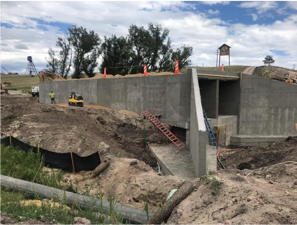
July 13 th , extension for box culvert H is complete. The ramp from westbound Powers and from northbound I-25 to North Gate Boulevard will cross Smith Creek at the new two cell box culvert. The box culvert is 91-feet long.