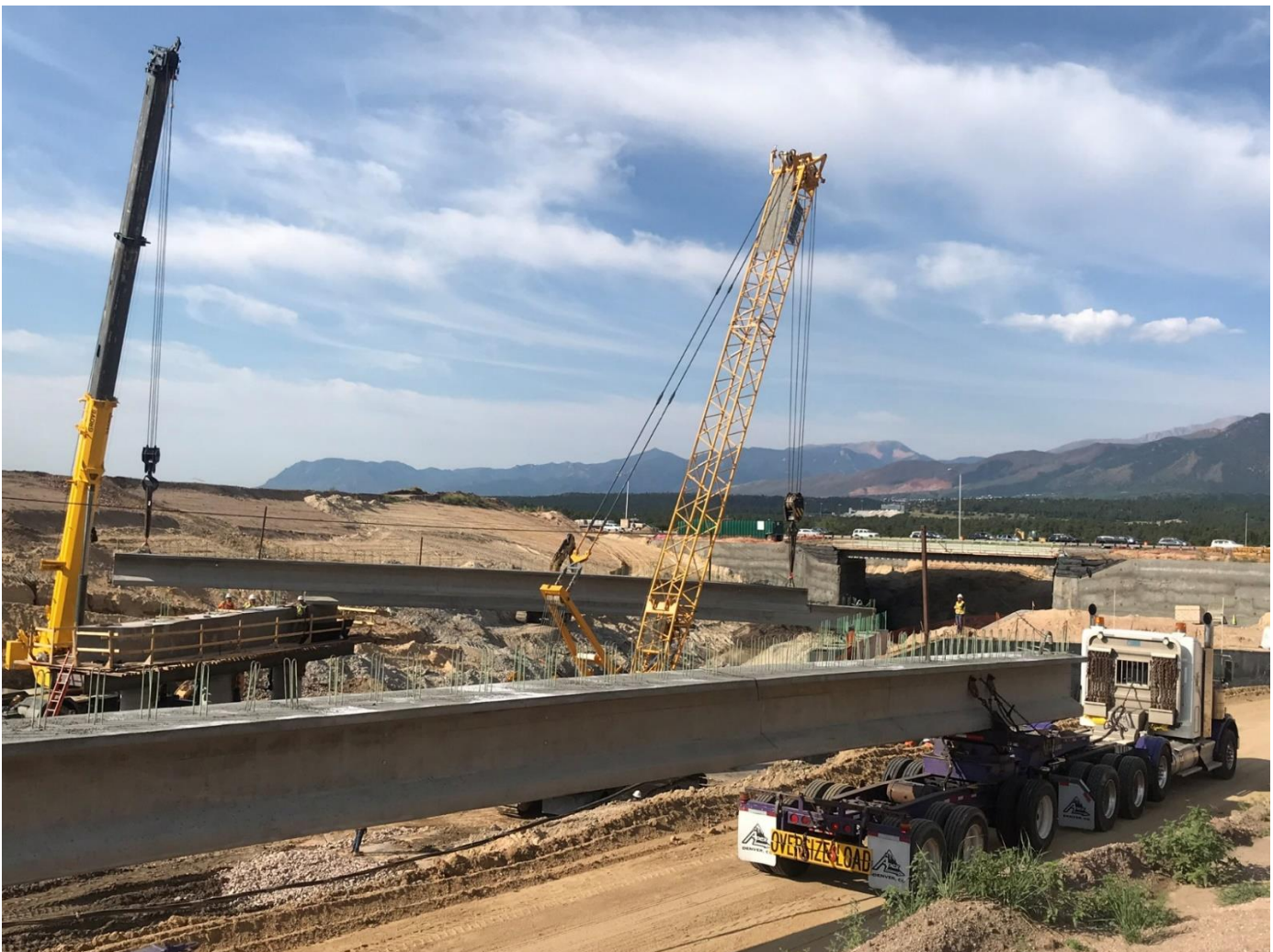
July 22 nd , girders have arrived and are being set for the two span QJ bridge. Each girder is 3.5-feet deep and 95-feet long.