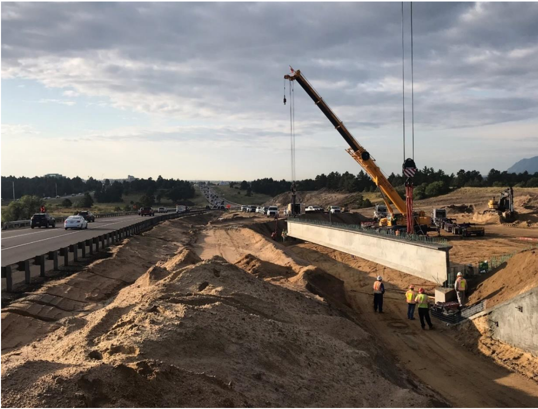
The first girder for Bridge DH was set on September 1 st .