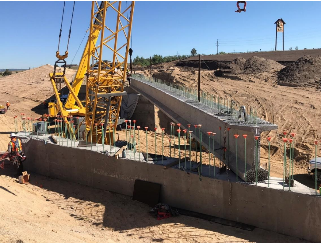
June 23 rd , girders were set for bridge DK. Each girder is 120-feet long and 4.5-feet deep.