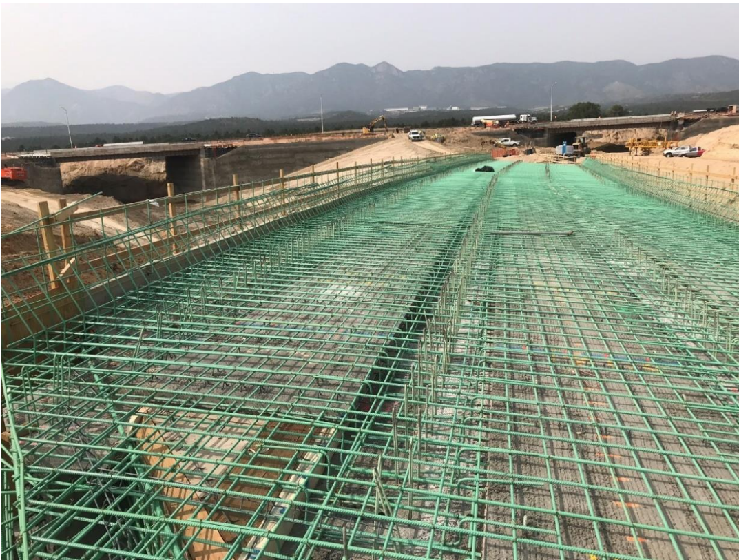
Epoxy coated rebar is placed over the deck panels. Bridge QJ is now ready for the deck to be poured. Bridge DI & Bridge DJ are in the background.