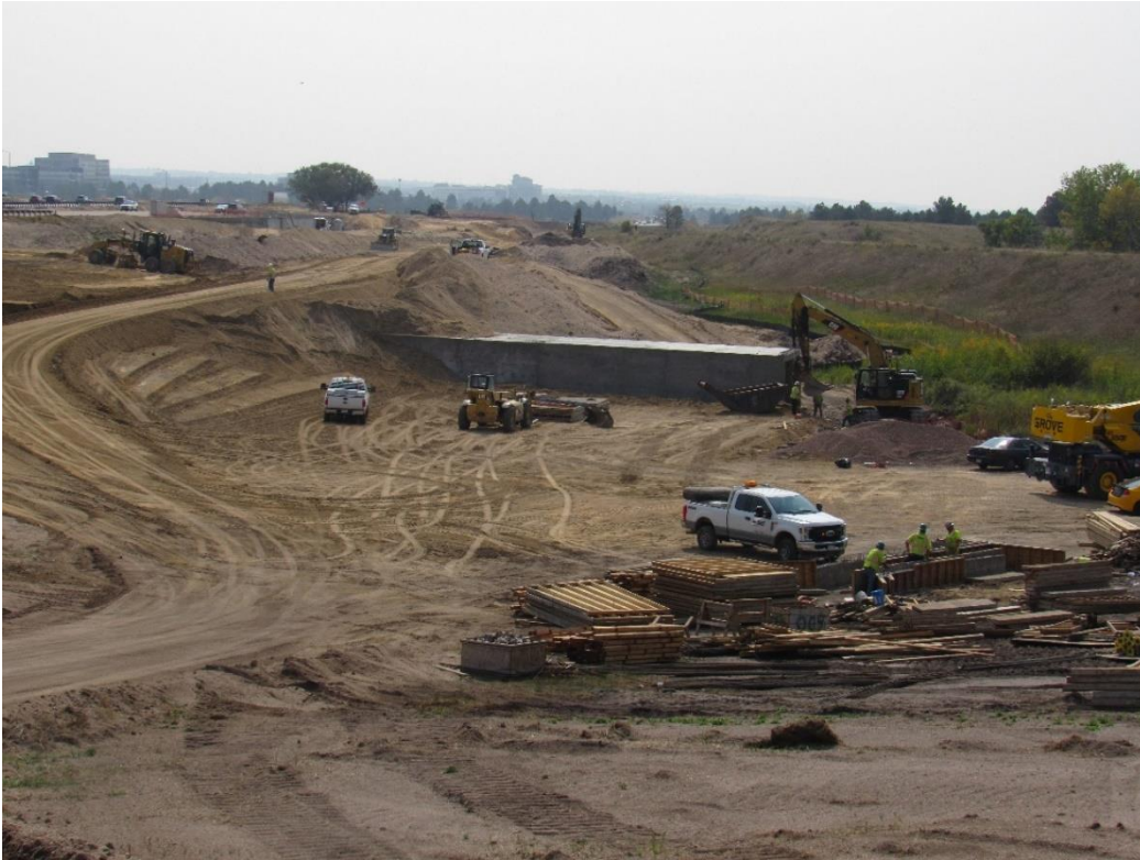
Located on the west side of I-25, Box Culvert AL is being constructed to take traffic from southbound I-25 and North Gate Boulevard to eastbound Powers and from North Gate Boulevard to southbound I-25. Box Culvert AL is 277-feet long. The box culverts are being constructed by Wildcat Construction out of Colorado Springs