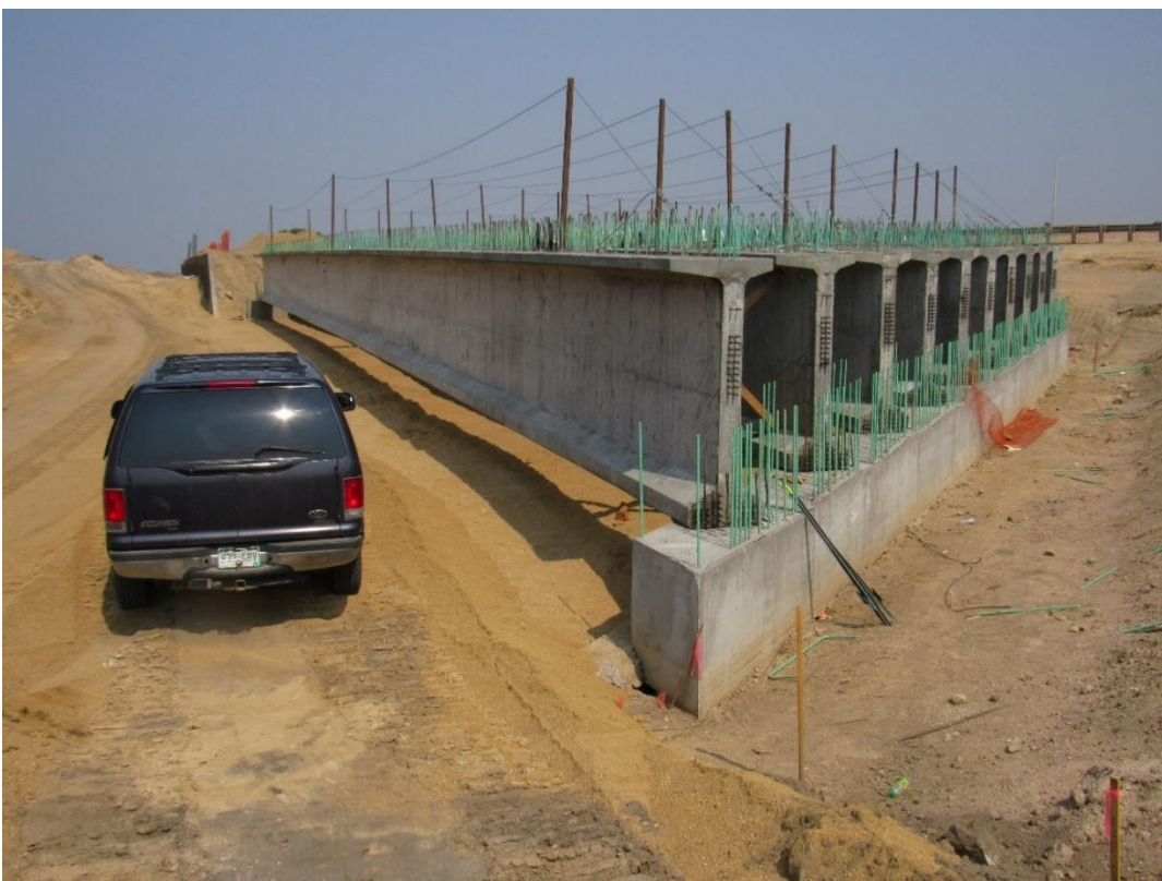
These girders are big. 170-foot long and 7-foot high. Each girder weighs approximately 85-tons.