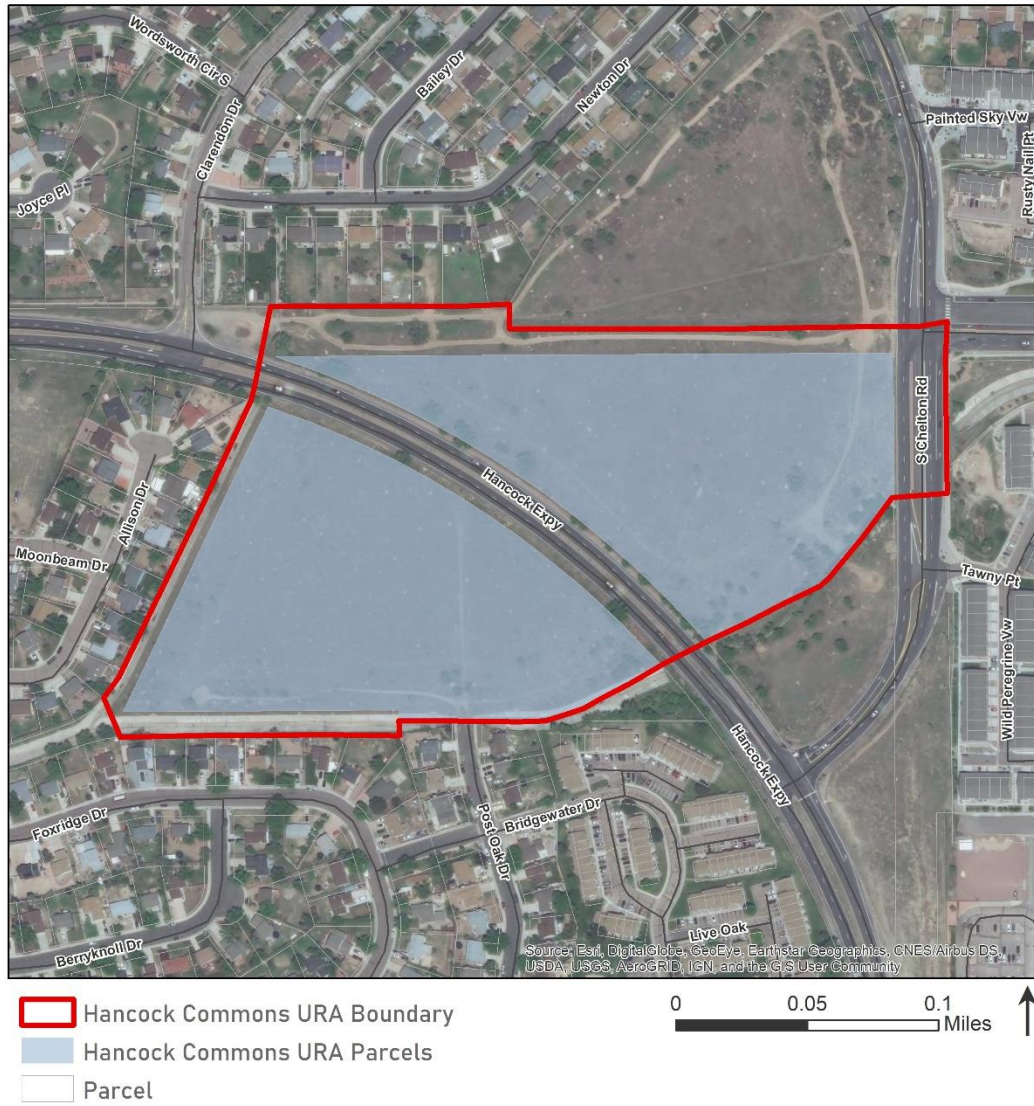
Figure 1. Hancock Commons Urban Renewal Plan Area