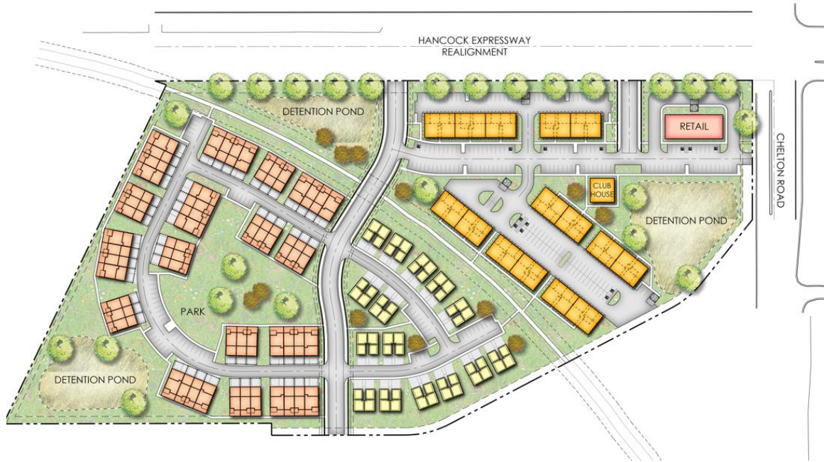
Figure 2. Hancock Commons Site Plan