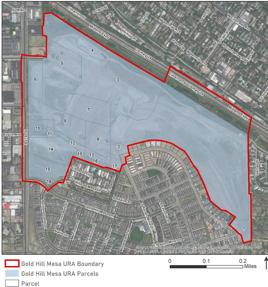
Figure 1. Gold Hill Mesa Urban Renewal Plan Area

more particularly described on Exhibit A attached hereto and made a part of hereof.