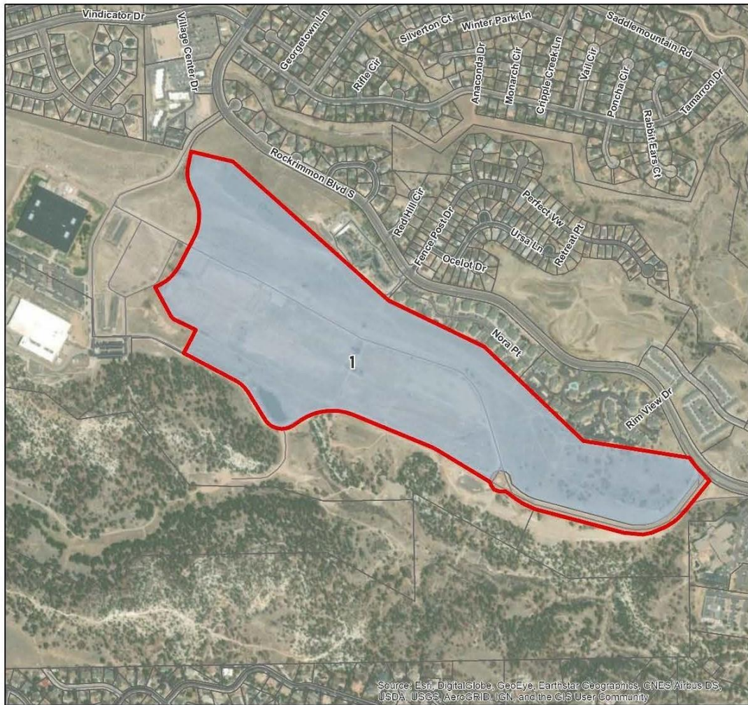
Figure 1. Project Garnett Urban Renewal Plan Area

The boundaries of the Area to which the Urban Renewal Plan applies includes the property known as 301 South Rockrimmon, as shown below.