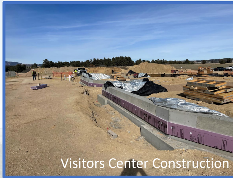
Visitors Center Construction