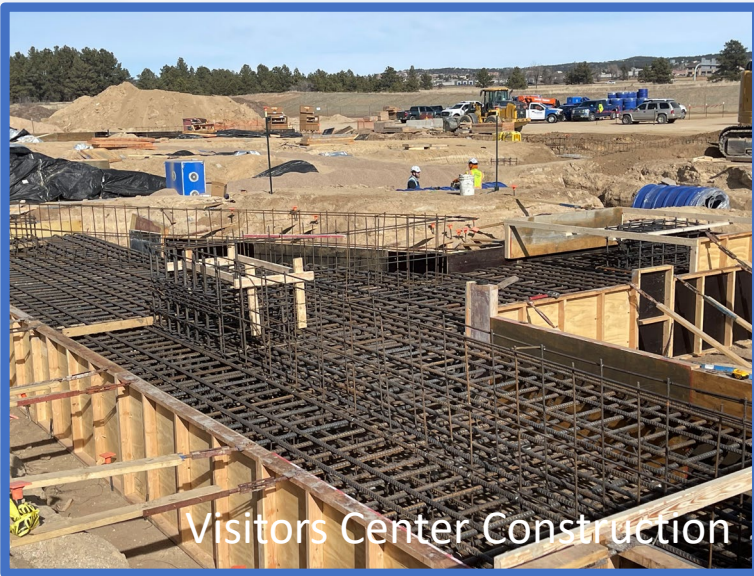
Visitors Center Construction