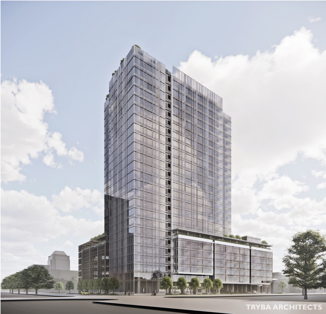
Residential Building at Costilla & Sahwatch