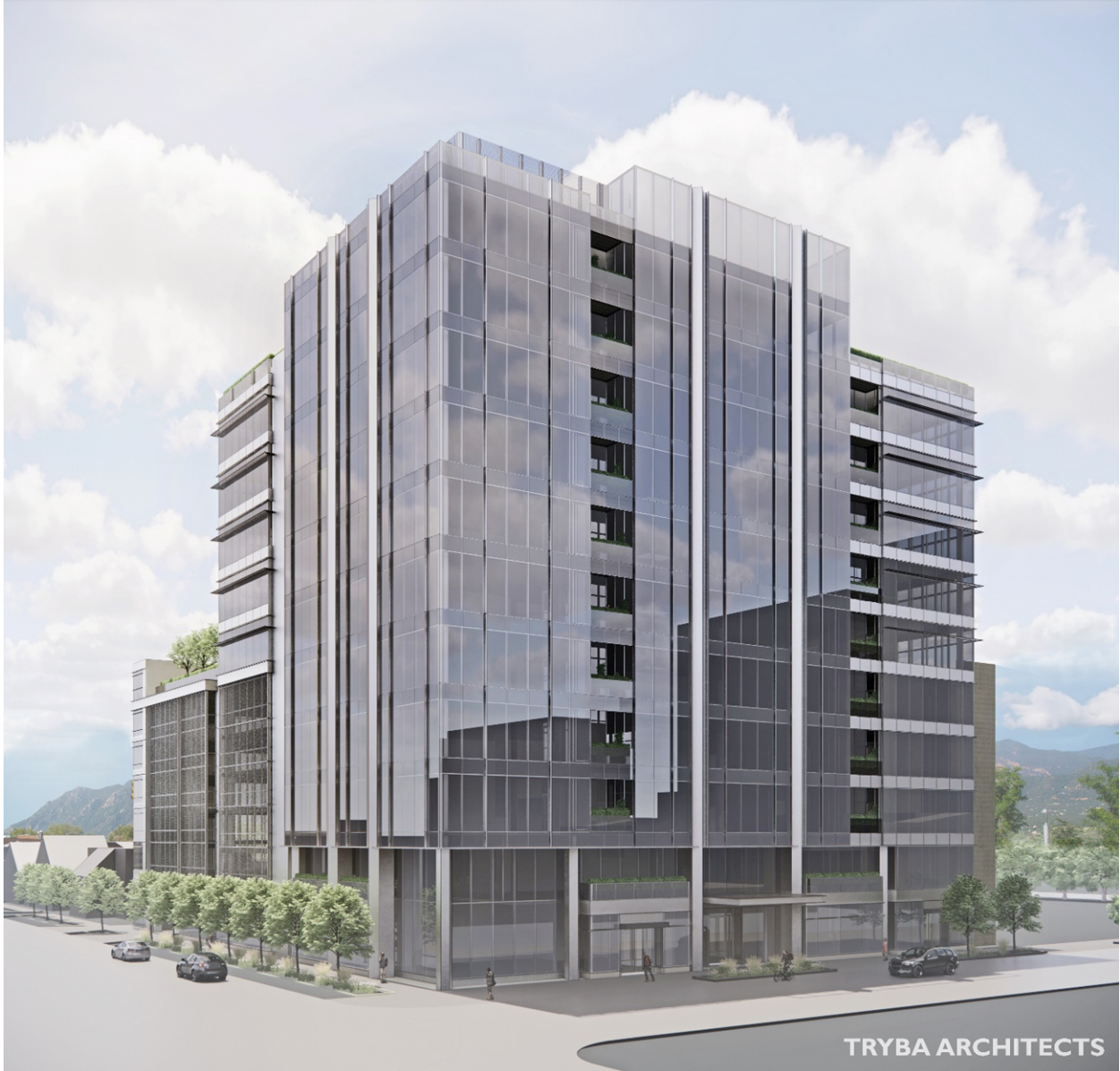
Office Building at Vermijo & Cascade