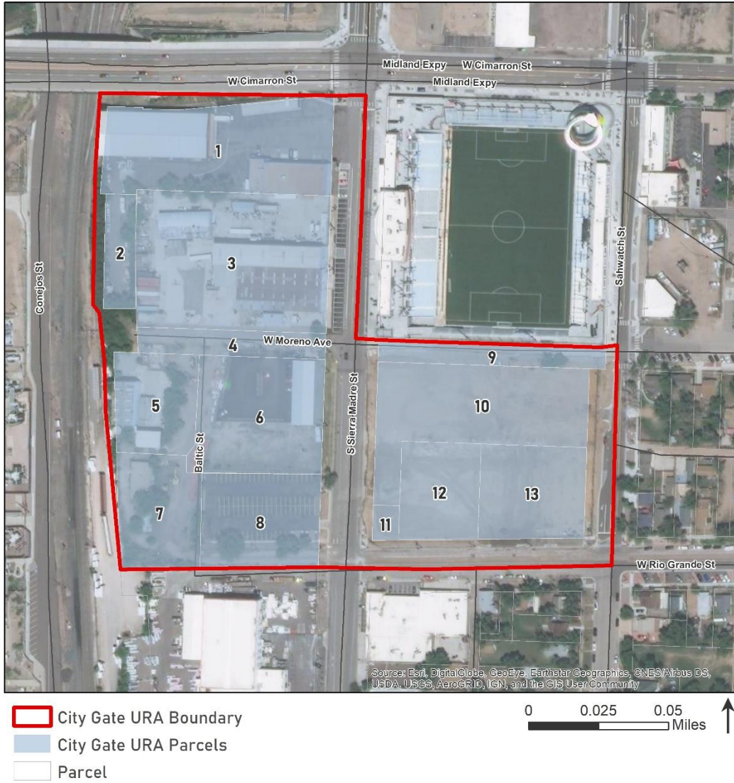
Figure 1. City Gate Urban Renewal Plan Area