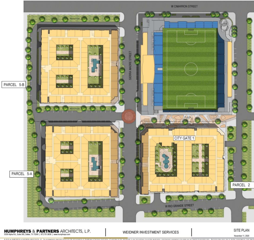
Figure 3. City Gate Phase 1 Rendering