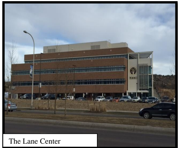
The Lane Center

Construction is ongoing for the Colorado General Hospital, a 52 bed hospital that is located near I-25 along the west side of N. Nevada Ave.