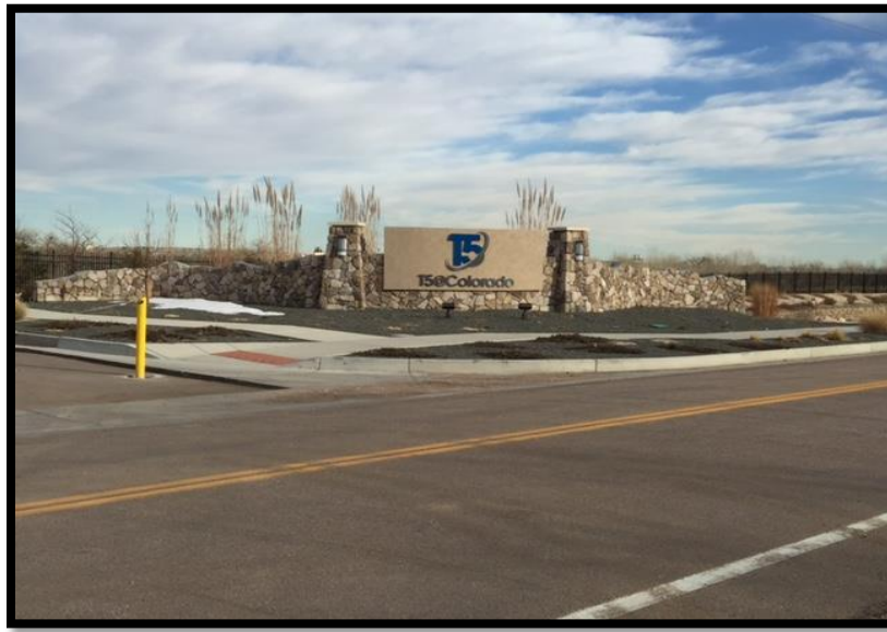
West Side Entrance

Location: The boundaries of the Area include approximately 109 acres of land generally defined to include 4 legal parcels plus public rights-of-way. Geographically, it is situated in southern Colorado Springs near the vicinity of Interstate 25 (I-25) and Circle Drive, immediately east of I-25, west of Fountain Creek, north of Spring Run (irrigation canal), and south of El Pomar Youth Sports Complex.