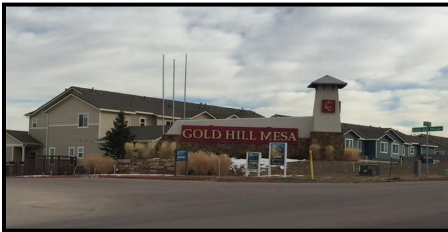
Twenty-first Street Entrance

The Area includes the site of a former gold processing facility known as the Golden Cycle Mill. The mill operated from 1906 to 1949 processed approximately fifteen million tons of ore from Cripple Creek and Victor area gold mines.