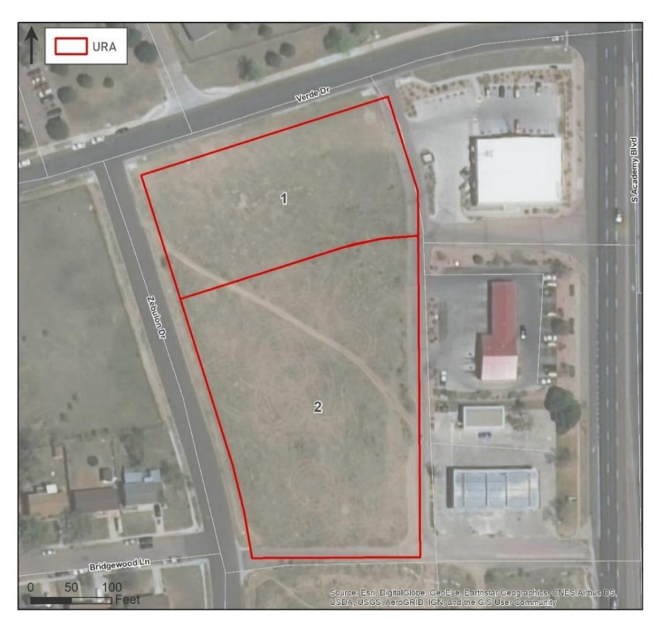
Figure 1. Almagre Urban Renewal Plan Area